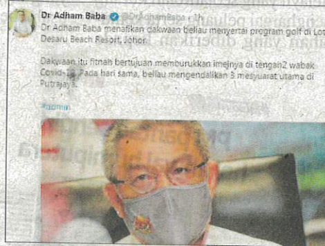
Dr Adham dalam ciapan Twitter semalam menafikan dakwaan beliau bermain golf di Desaru kelmarin.

SHAH ALAM – Menteri Kesihatan, Datuk Seri Dr Adham Baba menafikan dakwaan beliau menyertai program bermain golf di Lotus Desaru Beach Resort, Johor kelmarin.