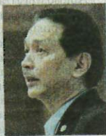
DR NOOR HISHAM

"Ini menjadikan jumlah kes dilaporkan mempunyai sejarah perjalanan ke Sabah sejak 20 September 2020 sebanyak 176 kes," katanya pada sidang akhbar di sini semalam.