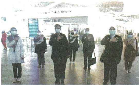
SEBAHAGIAN daripada 11 jururawat yang akan dihantar ke Hospital Semporna dan Hospital Tawau bagi membantu menangani peningkatan kes Covid-19 di daerah tersebut.

KUALA LUMPUR – Seramai 11 jururawat ditempatkan di Hospital Semporna dan Hospital Tawau bagi membantu pasukan perubahan di kedua-dua hospital yang terkesan akibat peningkatan kes Covid-19 di Sabah.